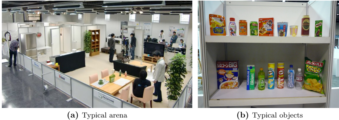
Figure 3.1: Scenario examples: (a) a typical arena, and (b) typical objects.