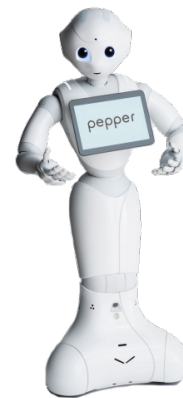
Figure 1.2: Softbank / Aldebaran Pepper

The robot to be used in the SSPL is the Softbank/Aldebaran Pepper, shown in Figure 1.2.