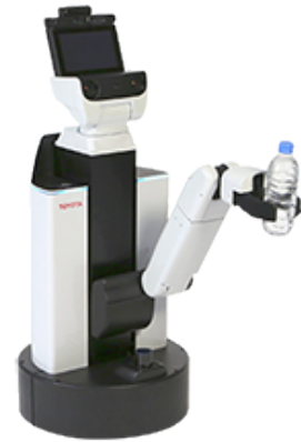
Figure 1.1: Toyota HSR

The robot to be used in the DSPL is the Toyota HSR, shown in Figure 1.1.